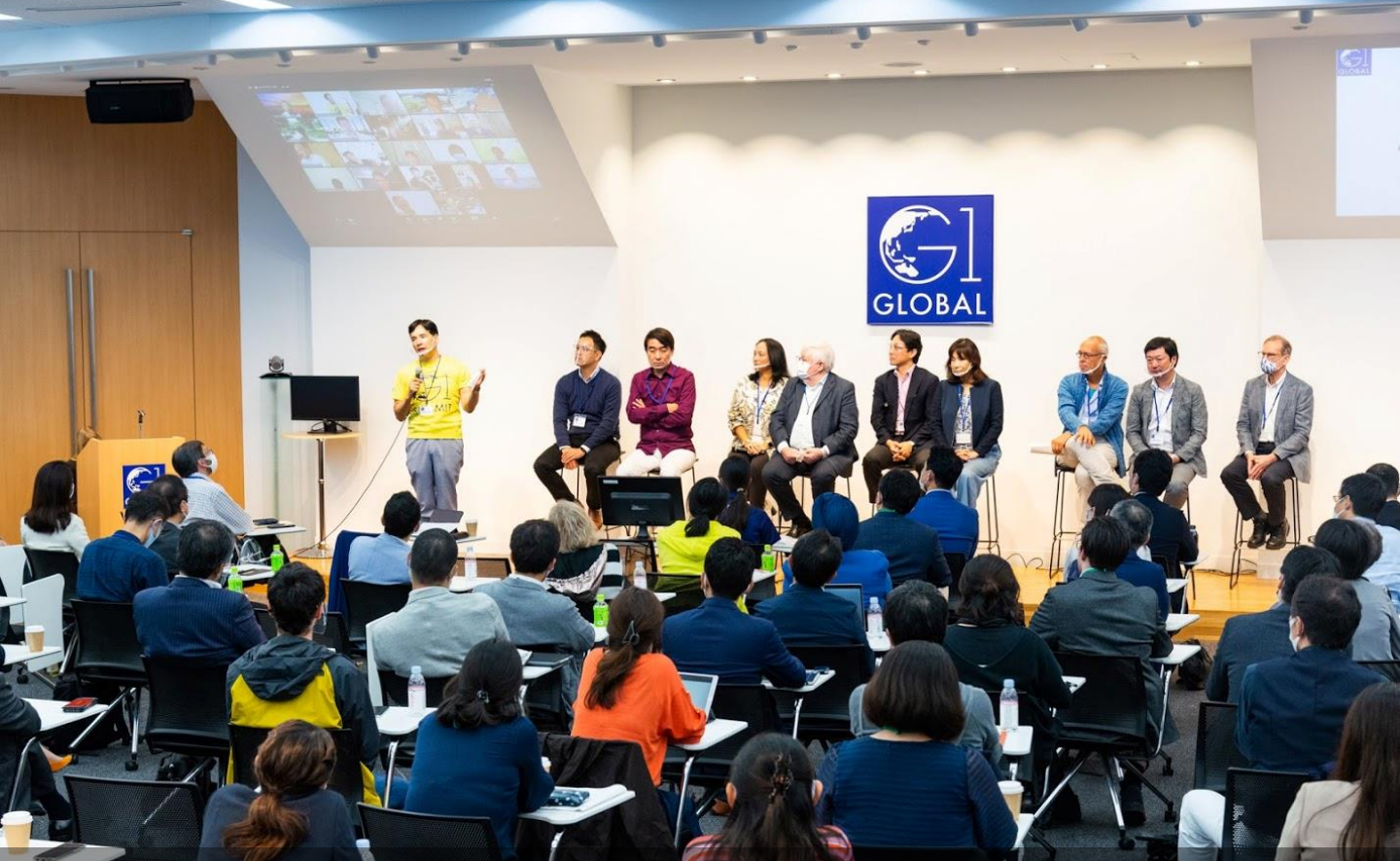
Closing Session with G1 Global Advisory Board Members