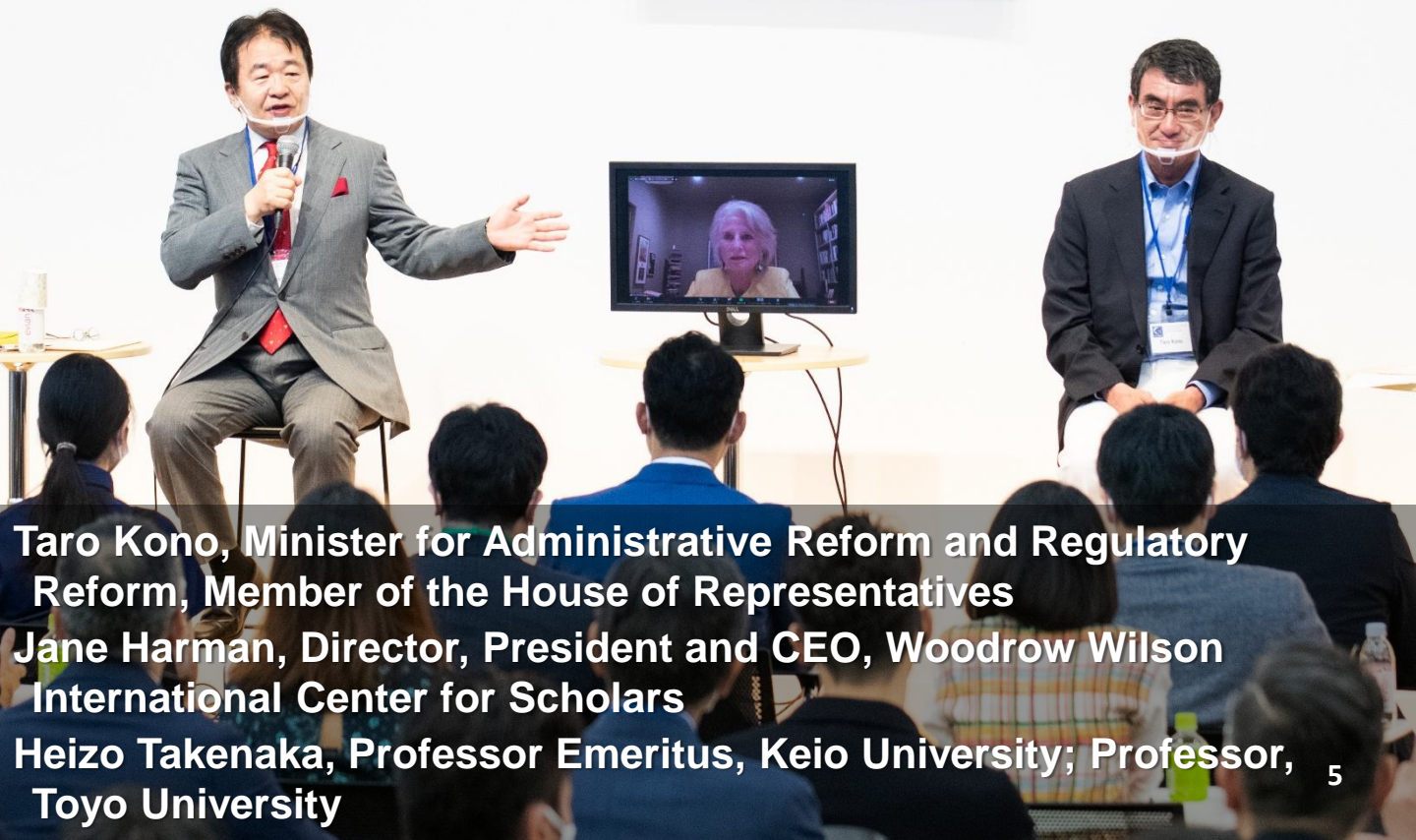
Taro Kono, Minister for Administrative Reform and Regulatory Reform, Member of the House of Representatives Jane Harman, Director, President and CEO, Woodrow Wilson International Center for Scholars Heizo Takenaka, Professor Emeritus, Keio University; Professor, Toyo University