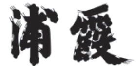
Urakasumi Sake Brewery Saura Co., Ltd.